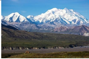
Denali – the tallest mountain in North America is 6144m tall and used to be called Mount McKinley